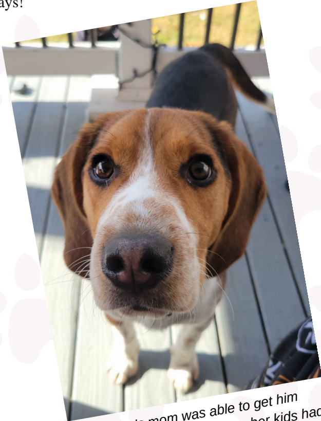
Archie's mom was able to get him neutered and still make sure her kids had a Christmas.

And while our voucher program has been an early adopter of spay/neuter assistance as vital to animal sheltering, only 60% of the families who apply for a voucher fix their pets. Families and their pets needed us to do more.