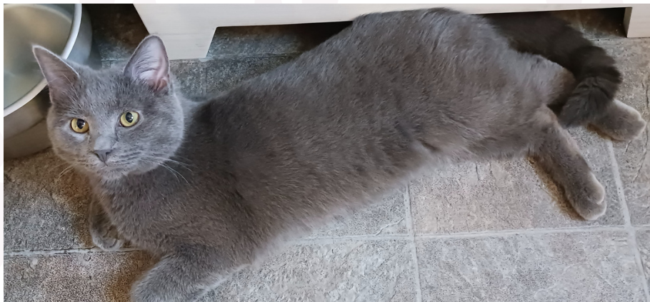
Smokie's mom was recently diagnosed with MS, and her family could not afford to have their precious girl spayed.